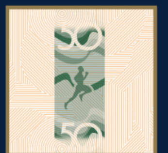
The ribbons in the background also move in tandem with the running athlete.