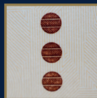
3 Three brown dots to aid the visually impaired can be felt when running your fingers over the edge of the note.