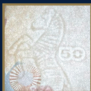
2 When the banknote is held up to light a watermark can be seen.